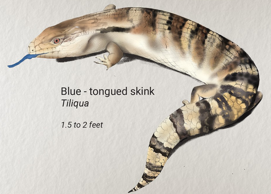
Blue - tongued skink Tiliqua