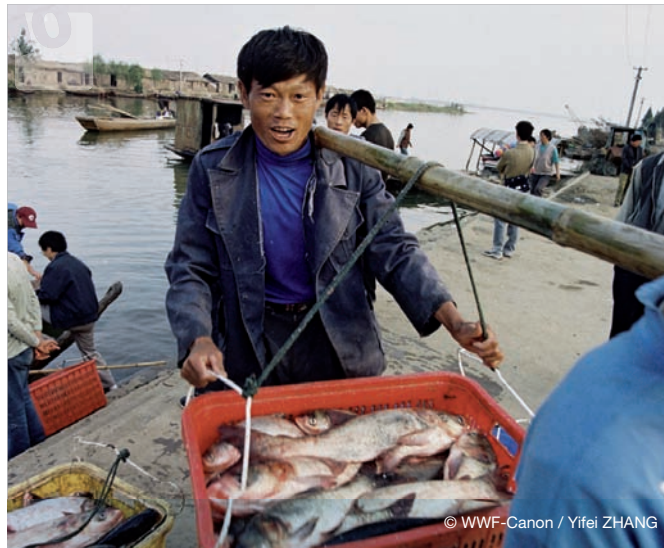
Fishing is a main livelihood on Zhangdu, site of conservation work supported by the WWF HSBC Yangtze Programme, Hubei Province, China.

Efforts to reduce pollution in the Yangtze River have been slow but promising. Community pressure has successfully increased local enforcement activities such as field inspections and increased pollution fees. China's pollution fee system was introduced in the early 1980s to control pollution and create an incentive for corporate investment in control projects (Pu 2003). Market reform has been an important factor in motivating industry environmental performance (Dasgupta et al. 1997 in Pu 2003). In fact, market reform and community pressure have generated as great an impact on industrial pollution as direct regulation and the charge-subsidy system (Pu 2003).