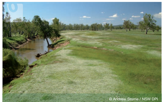
Flowering Lippia infestation along banks of Namoi River, near Boggabri, NSW, February 2004.