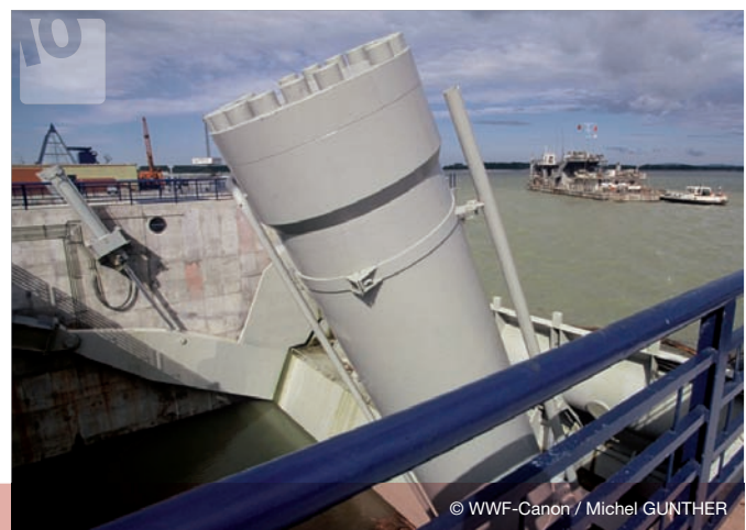
Lock gates at Gabčíkovo Dam on the Danube River, Slovakia.

Finally, we suggest some key solutions for better management in these basins. We end by summarizing the six threats and the ten basins representing these threats, and provide take-home recommendations under the framework of integrated river basin management.