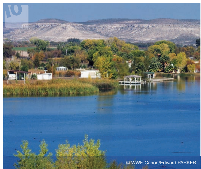
The Rio Conchos is the main source of irrigation water for crops (cotton & alfalfa) grown in the state of Chihuahua, Chihuahuan Desert, Mexico.

The Rio Grande basin is a globally important region for freshwater biodiversity (Revega et al. 2000). The Rio Grande supports 121 fish species, 69 of which are found nowhere else on the planet. There are three areas supporting endemic bird species as well as a very high level of mollusk diversity (Revenga et al. 1998; WRI 2003; Grommbridge & Jenkins 1998).