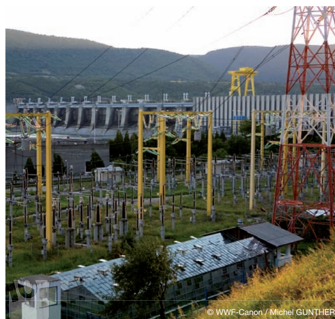
Hydro electric power station on the Danube River, Romania. The construction of this dam caused a 35 m rise in the water level of the river near the dam. The old Orsova, the Danube island Ada Kaleh and at least five other villages, totalling a population of 17,000, had to make way. People were relocated, but the settlements have been lost forever to the Danube.

Historically, the Danube has been home to seven fish species found nowhere else in the world, 10 diadromous 19 fish including five sturgeon species, and altogether 103 fish species, which is more than half of all in Europe (WRI 2003; WWF 2004b). The basin has 88 freshwater mollusks (with 18 found only in this basin) over 18 amphibian species and 65 Ramsar wetlands of international importance (WRI 2003; WWF 2005 - ecoregion). Today only 6.6% of the basin is protected (WRI 2003). The Danube delta on the Black Sea is one of Europe's most ecologically important areas and is shared 80% by Romania and 20% by Ukraine (UNESCO 2005) 20 .