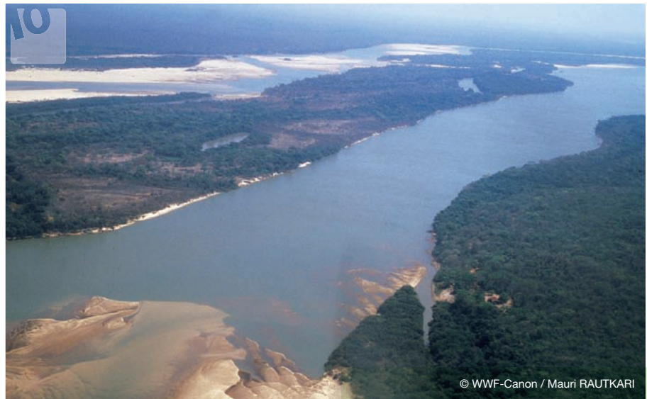
Aerial view of the Paraná River, Paraná, Brazil.

conducted collaborative research which led to a joint conservation strategy for over 1 million ha of contiguous Atlantic forest, and is an important step towards cooperative management of the region's Iguazu National Parks. Finally, WWF is seeking to develop representative protected areas in the Brazilian Pantanal, through the use of innovative incentives and policy mechanisms 34 , and plans to investigate a range of approaches to participatory involvement for local communities and government authorities.