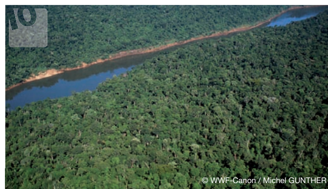
Iguazu National Park - Paraná River Atlantic Rainforest Paraná, Brazil.

Freshwater biodiversity is rich. There are over 350 fish species – the third highest among medium sized basins (WRI 2003). Of these, 85 are found nowhere else in the world (Revenga et al. 2000). This basin is also home to the rare La Plata River Dolphin (Reeves et al. 2003), and the only species of lungfish found in the Neotropics, Lepidosiren paradoxa (WWF 2005d). La Plata's Pantanal wetlands, located mostly in southwest Brazil but also extending to southeast Bolivia and northern Paraguay, are the largest freshwater wetland in the world, covering 140,000 Km 2 , and home to a vast array of wildlife (Bennett & Thorp no date; Living Lakes Partnership 2005). This biological diversity encompasses 650 species of birds - including parrots, hawks, eagles, kites, 260 species of fish, 90 species of reptiles, over 1,600 species of flowering plants, and over 80 species of mammals - including ocelots, jaguars, and tapirs (Hulme 1999; Living Lakes Partnership 2005). Thousands of permanent and semi-permanent lakes and ponds supporting the most diverse floating aquatic plant community in the world cover the Pantanal's lowest areas (Por 1995 in WWF 2001a). During the wet season, this wetland acts as a gigantic natural control mechanism for the floodwaters of the Paraguay River (Hulme 1999).