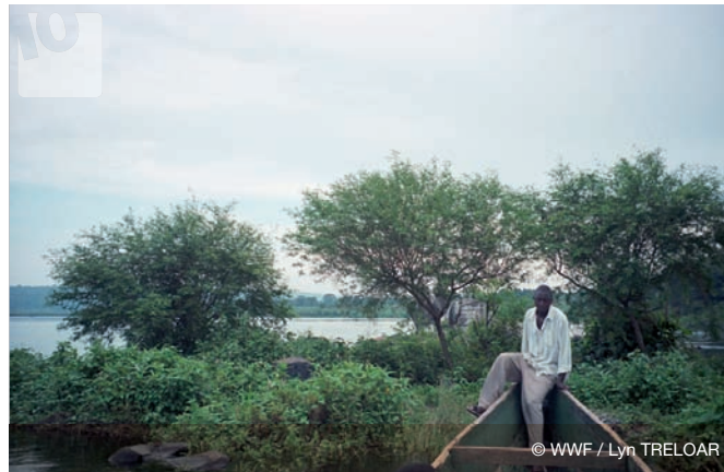
The Lake Victoria source of the Nile. The river originates from two distinct geographical zones, the basins of the White and Blue Niles.

In the Mara river watershed in Kenya and Tanzania, which drains into Lake Victoria, WWF is facilitating stakeholder dialogue on integrated river basin management for regional and district government institutions, non-governmental organizations and communities. This includes work to: protect the forest sources of the river on the Mau escarpment, model environmental flows, and develop water sharing agreements needed to sustain people and nature along the river.