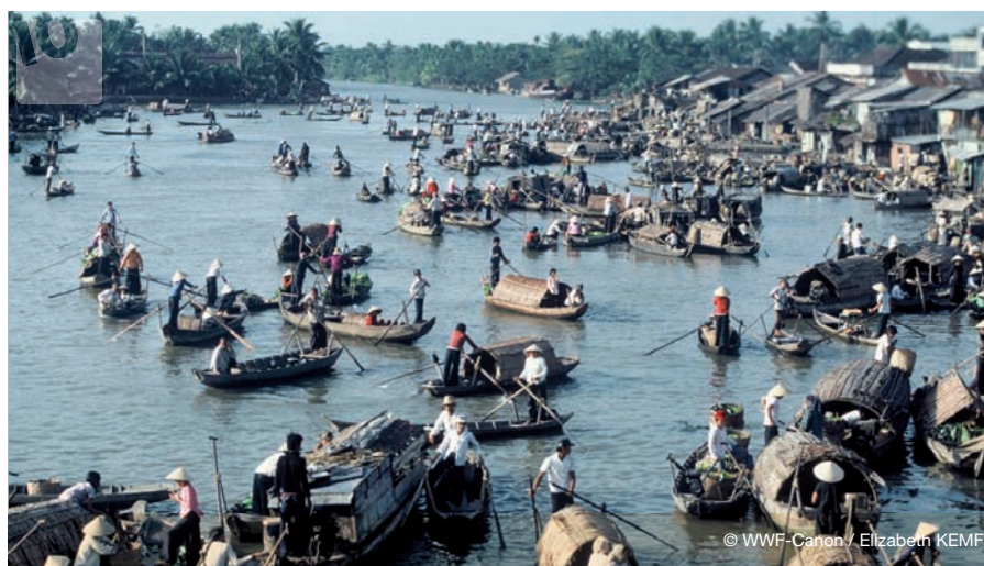
Sampans meet at early morning market in the Mekong delta, Vietnam.

In 1995, all basin countries except the two upper basin states, China and Myanmar, signed the Mekong Agreement and revitalized the Mekong River Commission 66 to promote cooperative management of the river (Water Policy International Limited 2001). Though the Commission has made progress in its relations with China and Myanmar in sharing information on fisheries and hydrological data, insufficient attention has been paid to halting overfishing throughout the basin. Areas threatened by overfishing need better institutional capacity to create and enforce legislation on fishing methods and rights. In addition, community-based fishing cooperatives, improved communication between stakeholders and integrated basin management are essential in protecting beneficial flooding and the Mekong River's resources.